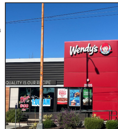
Photo of the Wendy’s on N Blackstone Avenues and E Weldon Ave on April 8. Students can get a discount on meals just by using their student ID.