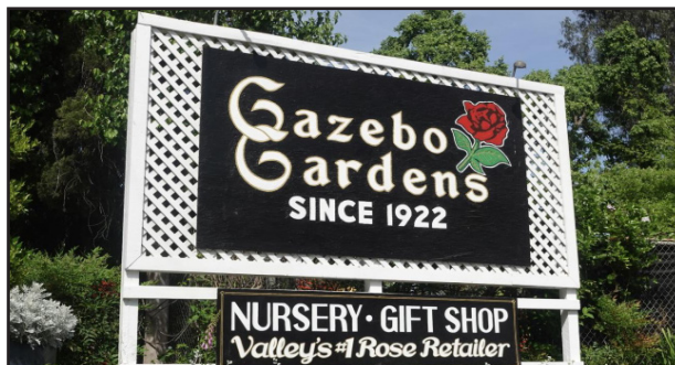
Gazebo Gardens’ welcome sign on Van Ness Blvd and Fresno Street on March 26.

This is a Tower District classic, and it is right down the street from Fresno City College. It was originally a nursery, and while it still is, it is now known for its beer, food trucks and live music.