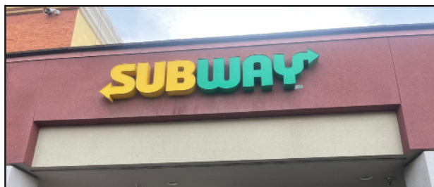
Photo of the Subway on E Kings Canyon Road and S Clovis on April 8.

devices and software, with Microsoft providing free access to Office 365 for eligible students. Whereas Dell provides students up to 20% off on laptops. HP offers 30-40% off any selected device. Samsung has a Education Offer Program that gives discount deals on laptops, phones and accessories.