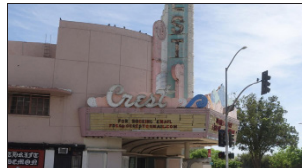
Historic Crest Theatre’s entrance on Broadway Plaza and Fresno Street on March 26.

To buy tickets it is $5 cash only, or you can go early and purchase them on eventbrite.