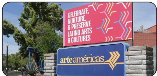
Arte Américas’ monument sign on Van Ness and Fresno Street on March 26.

Arte Americas is a museum in downtown Fresno located at 1630 Van Ness Ave. Their mission to, “celebrate, nurture, and preserve Latinx arts and cultures” according to their website.