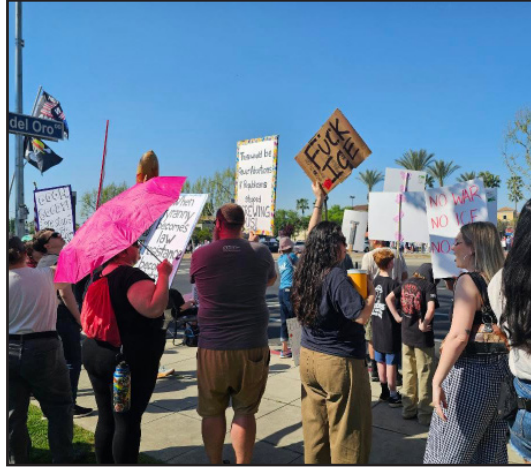
Protesters holding signs expressing hope for change during the No Kings protest by River Park on March 28.

grocery store without the fear of thinking, 'What if ICE is there?' I mean she's got a green card and she's here legally, but that doesn't matter anymore. I have that fear that one day I'm going to get that call from someone saying that my mom was taken. My heart breaks for my culture and not being able to show it and this is how we can."