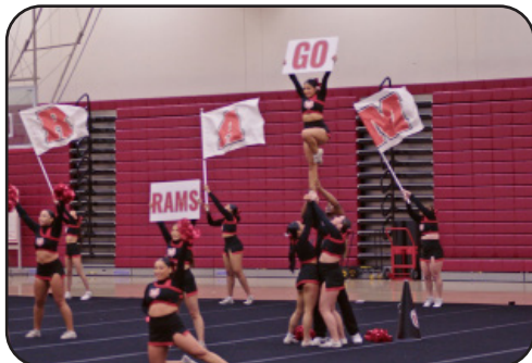
Fresno City College Cheer performing for their nationals send off in the FCC gymnasium on Feb. 16.