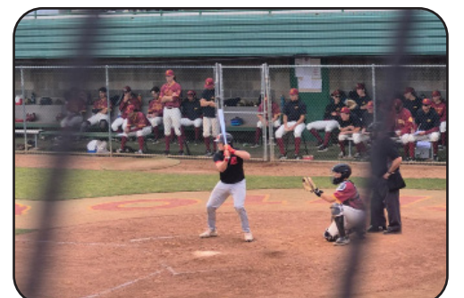
Fresno City College baseball player up to bat against Sacramento City College on Feb. 14.

As of the time of writing this article, the Rams finished their three-game series against Porterville with another dominating 10-2 win.