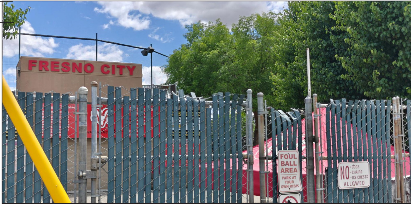
Photo of the Baseball field at Fresno City College.