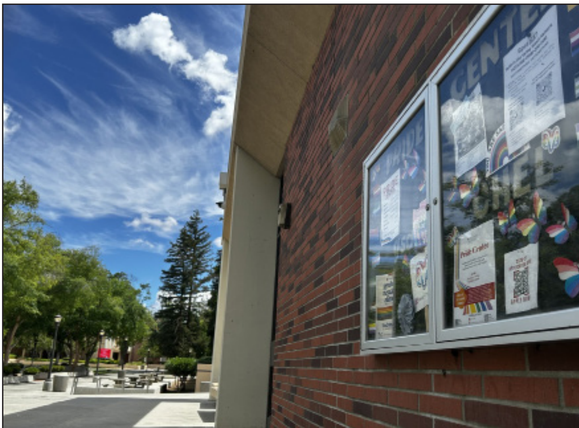
The Pride Center's bulletin board located in LI-143 on Fresno City College campus facing the center on April 11.