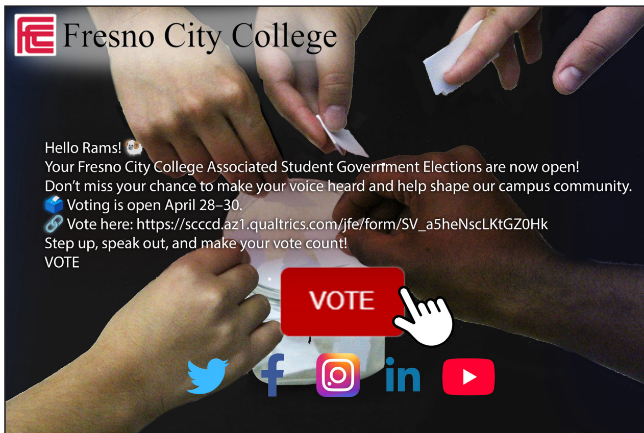
A photo of Fresno City College students putting their vote in a jar below the email sent out by the college to vote for Associated Student Government representatives. On the bottom are social platforms to share the link to.