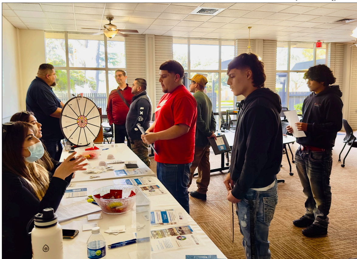
THE FIRST JOB FAIR OF THE SPRING 2024 SEMESTER WAS ON FEB. 23. THE JOB FAIR IS ORGANIZED BY FCC TO HELP STUDENTS AND ALSO THE COMMUNITY MEMBERS TO APPLY FOR A POSITION AT SPAN.

FCC is hosting a spring job fair on Wednesday, April 17 from 9 a.m. to 12 p.m. in front of the FCC library. About 40 employers are looking to hire.