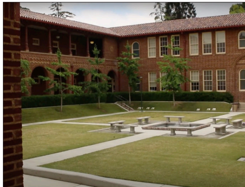
THE WEST COURTYARD WHERE THE OPENING CEREMONY WILL TAKE PLACE ON MARCH 21, 2024.

The Social Justice Center will be open Monday