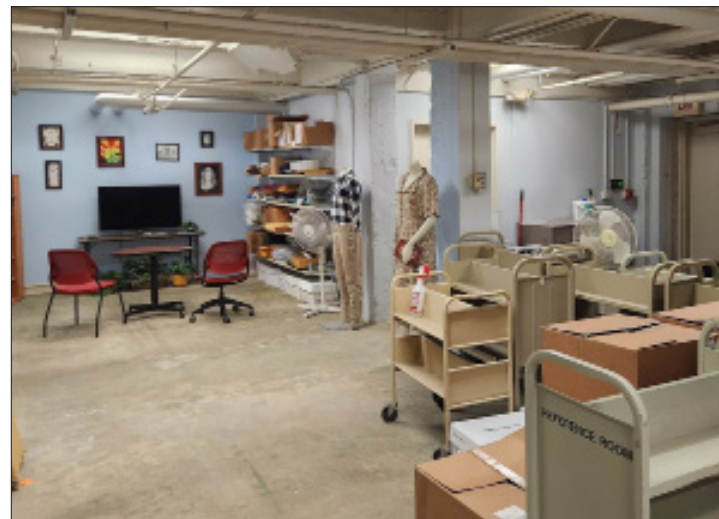
ARCHIVE: THE BASEMENT OF THE FRESNO CITY COLLEGE LIBRARY, PREVIOUS LOCATION OF THE CLOTHES CLOSET ON CAMPUS, NOV. 13, 2023.

"I'll definitely be donating my inputs. If you're a student who wants to donate, it'll go to a good cause: your peers, your fellow students and those in need," Howard said. "It's going to make Fresno City College a better place."