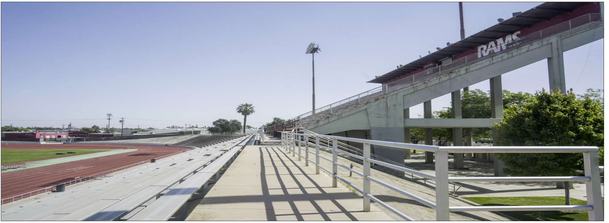
FRESNO CITY COLLEGE STUDENTS AND STAFF RAISE CONCERN ABOUT RATCLIFFE STADIUM NOT FULLY COMPLYING WITH THE AMERICANS WITH DISABILITIES ACT. PHOTO TAKEN ON MAY 2, 2024 BY MICHAEL LIN.