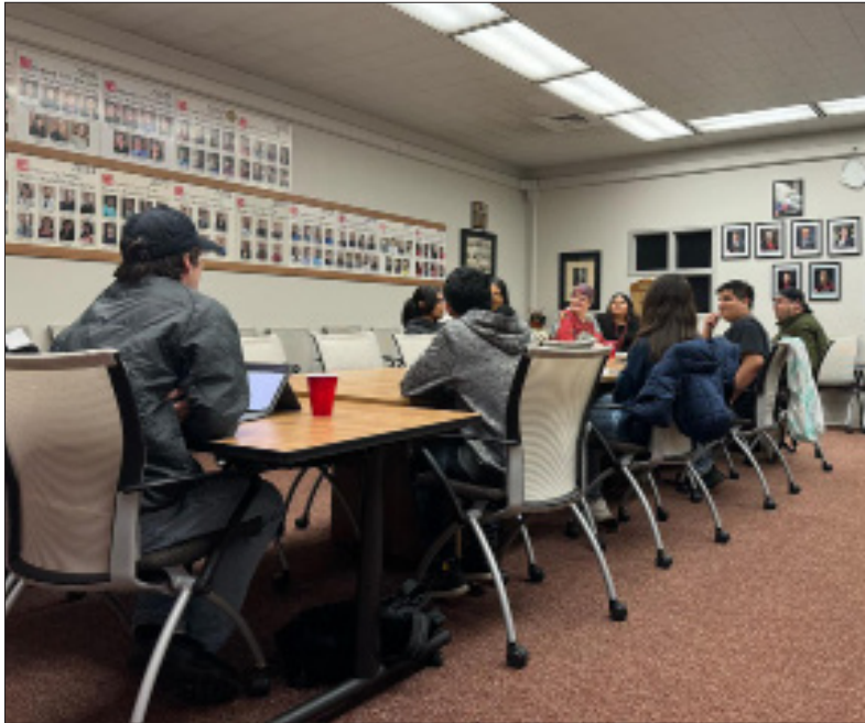
THE FIRST FRESNO CITY COLLEGE DEMOCRAT MEETING IN THE SENATE CHAMBERS AT FRESNO CITY COLLEGE ON FEB. 8.

"Members can look forward to guest speak-