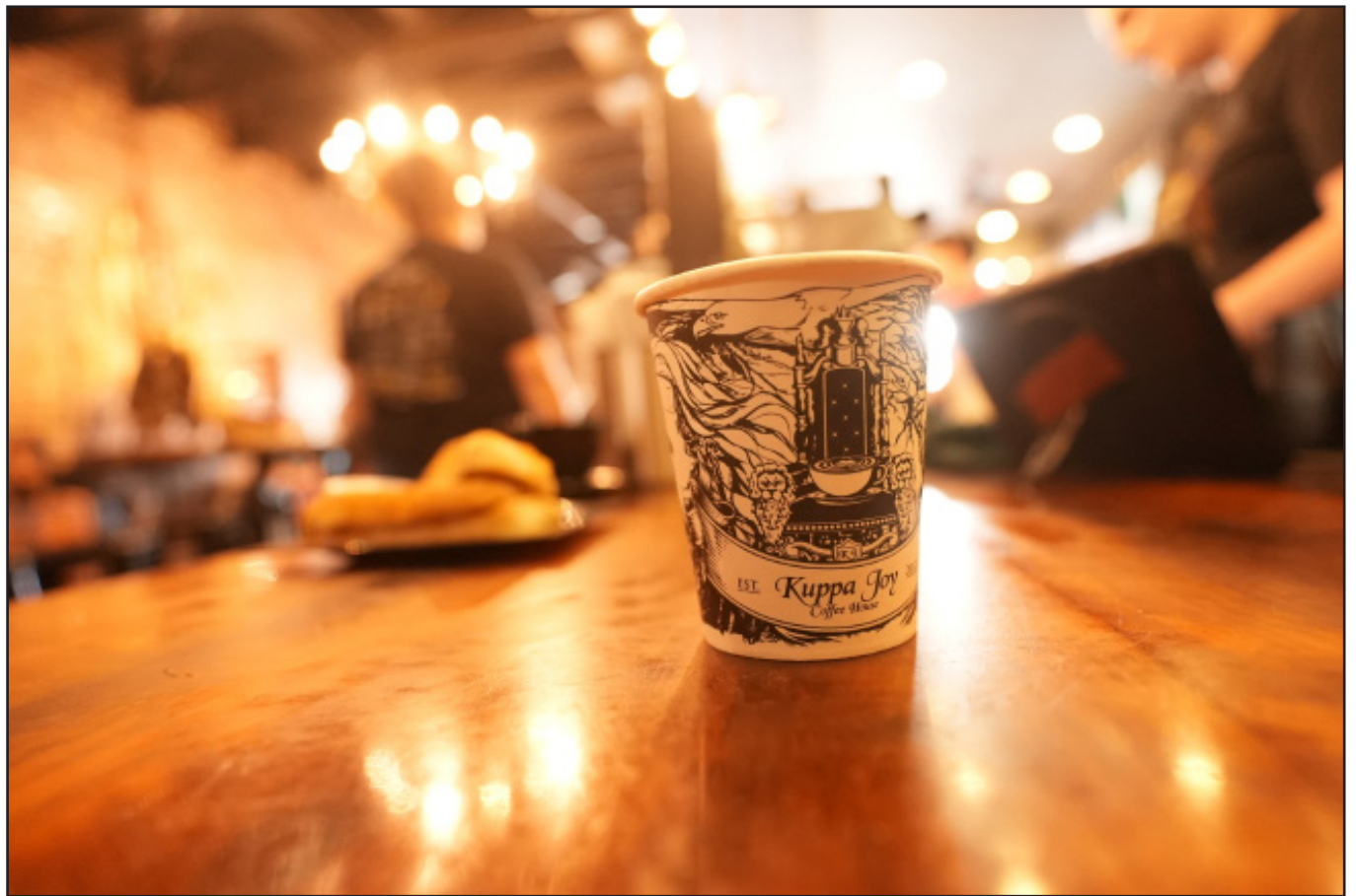
The first Kuppa Joy Coffee Shop opened its doors in 2012 at Old Town Clovis.