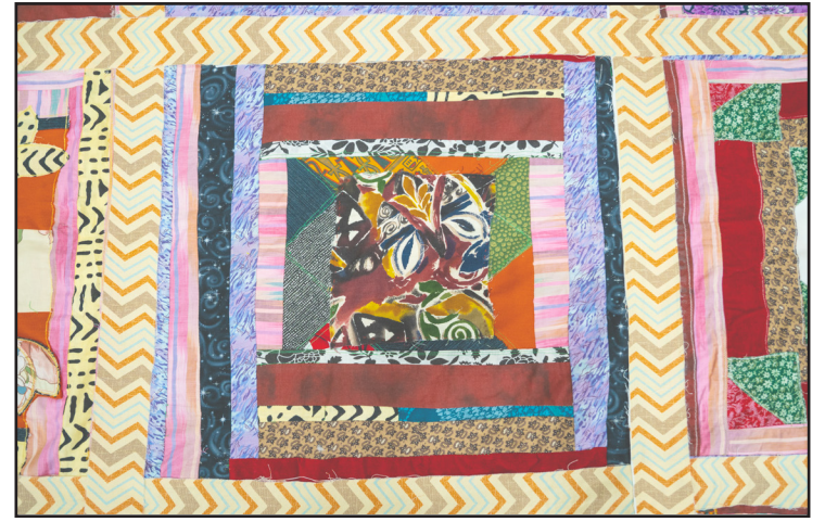
PATTERNED QUILTS WERE USED AS INSPIRATION FOR THE ART OF THE WATER FEATURE AT THE WEST FRESNO CENTER ON SEPT. 3.

Planning of the project is expected to be completed by the end of the current fall semester while the final piece is to be installed at the West Fresno Center campus by Feb. 2026 in time for Black History Month.