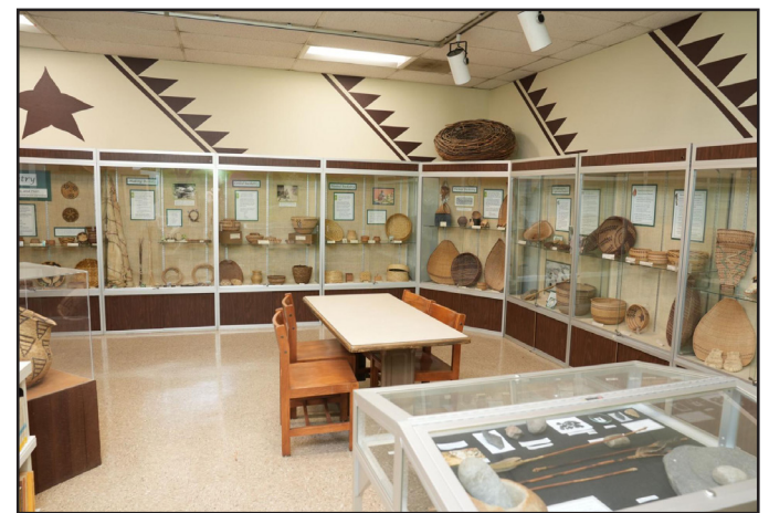
Photo of the Anthropology Museum's interior on Nov. 24.

"There are artifacts in that museum that belong to the tribes of current students, current faculty, current staff and seeing those in an important space is imperative, I think that it's vital to seeing your culture and honoring it," Khan said.