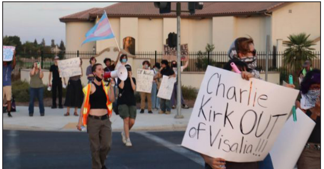
ONE PROTESTER (RIGHT) HOLDS A SIGN THAT READS "CHARLIE KIRK OUT OF VISALIA!!!" AS OTHER PROTESTERS CROSS THE INTERSECTION OF CALDWELL AND AKERS TO VOICE THEIR FRUSTRATION AGAINST CHARLIE KIRK'S APPEARANCE AT THE VISALIA FIRST ASSEMBLY OF GOD CHURCH IN VISALIA ON SEPT. 2.

Logan Payne | Editor-in-Chief lpayne@therampageonline.com