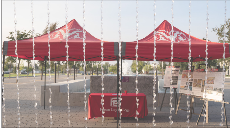
DISPLAYS IN FRONT OF THE WEST FRESNO CENTER WATER FEATURE ON SEPT. 3 DESCRIBE THE PROCESS AND INSPIRATIONS FOR THE ARTWORKS TO BE INSTALLED.

Its vibrant clay tiles will take the form of a quilt, drawing inspiration from distinct cultures in West Fresno. The referenced textile and craft traditions include Yokut basket weaving, embroidery,