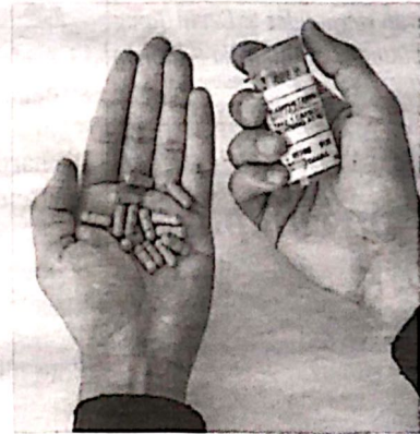
ADHD medication, like Adderall, have been on shortage since Oct. 12, 2023.

Having Kaiser Permanente as my medical insurance has been hard. Frustration has built up, I have been on and off my medication and it's hard to express the impact it has had on me.