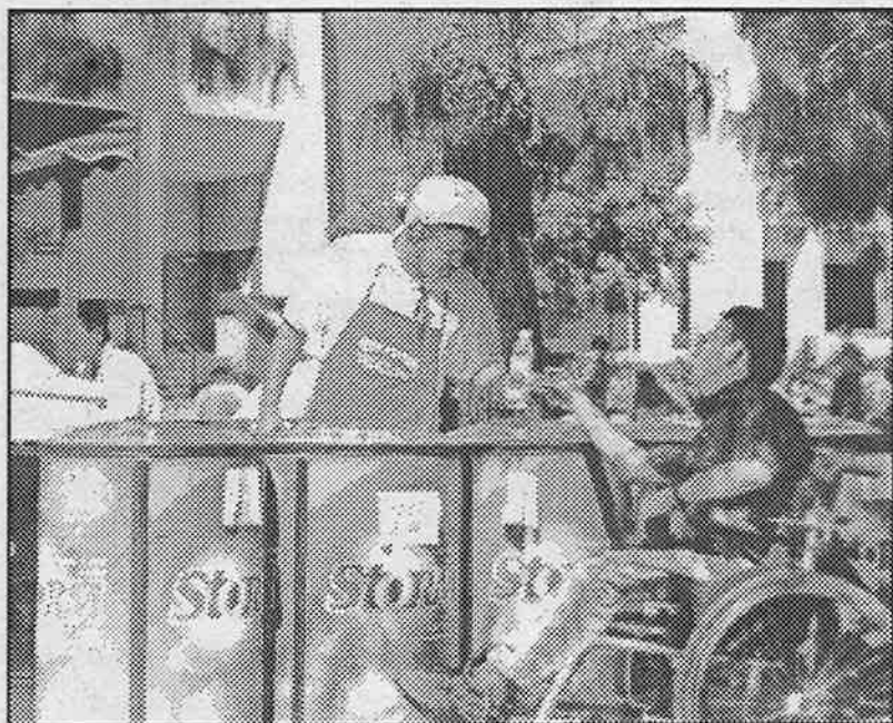
Student disregard for disabled students make it difficult for all.