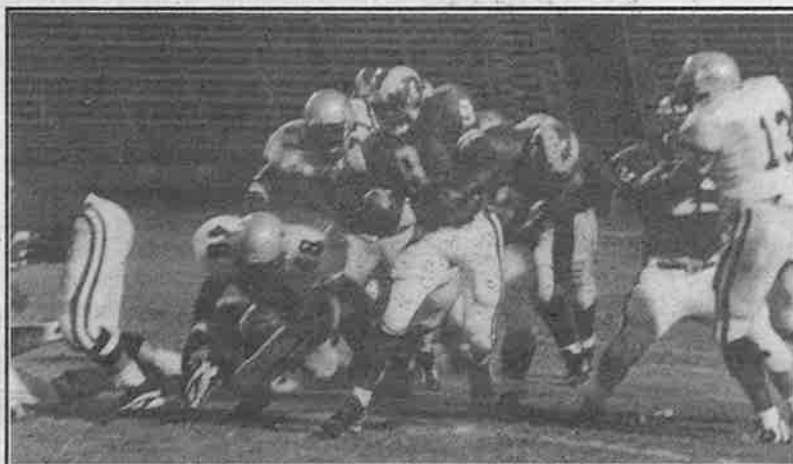
Although thought by some to be inexperienced, the Rams prove themselves to be worthy competitors.