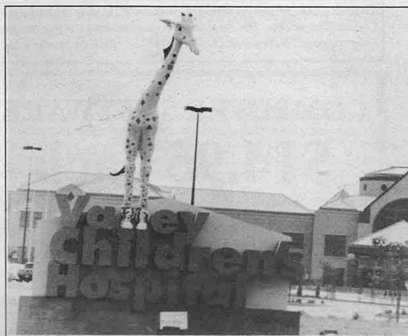
The hospital is distinctly larger than it's previous Fresno location.

The new Valley Children's hospital is a more appetizing environment for children. It has five brightly colored sections and individually decorated rooms.