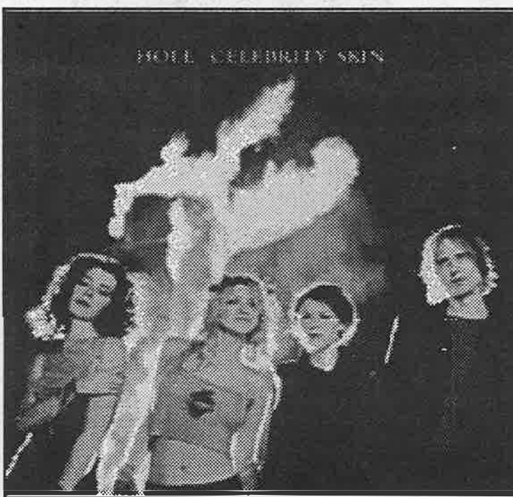
Hole's new album "Celebrity Skin" is now available in stores

The band had made it a goal to sit down again and really write