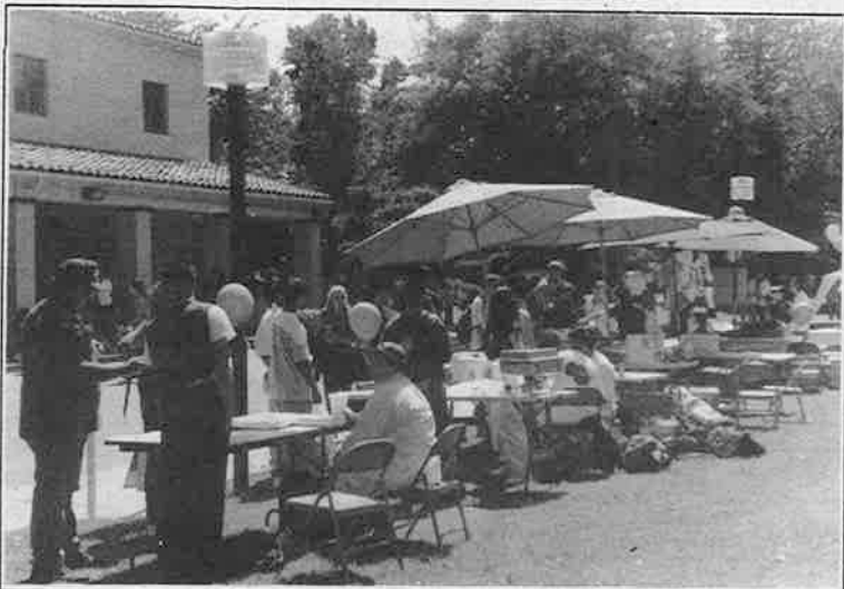
Students gather around the various booths while enjoying the music during Club Awareness Day. The event coerced many students out into the quad and encouraged them to join clubs.

Students come out to promote their organizations, fundraise