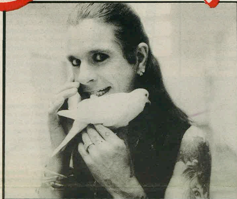
Ozzy Osbourne is famous for his outrageous style and longevity in music.