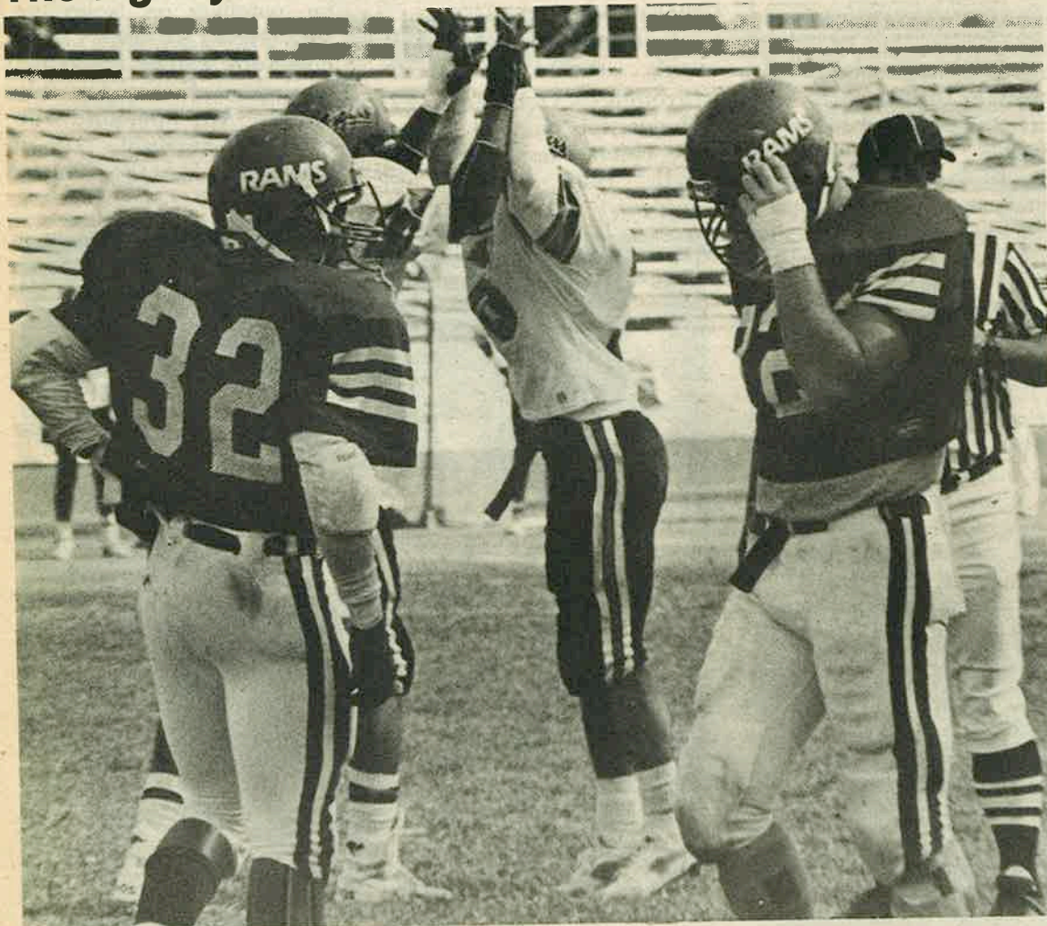
Kings River CC flies the "high five" while the Rams can't believe what has happened. Plays like this one helped to ensure a victory for the Tigers Saturday at the Rams homecoming game.