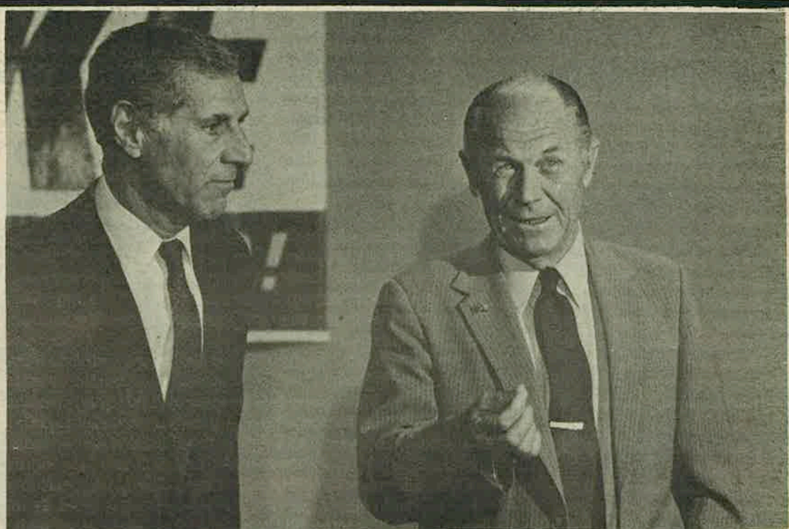
Gov. George Deukmejian listens as retired Gen. Chuck Yeager fielded questions from the press Monday. The two met for the first time in Fresno and spoke together Monday night at the Centre Plaza Hotel downtown.