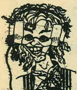
By Hooter McNabb

ALEXIS KORNER/SNAPE: "Accidentally Borne in New Orleans" —War. Bros. BS 2647