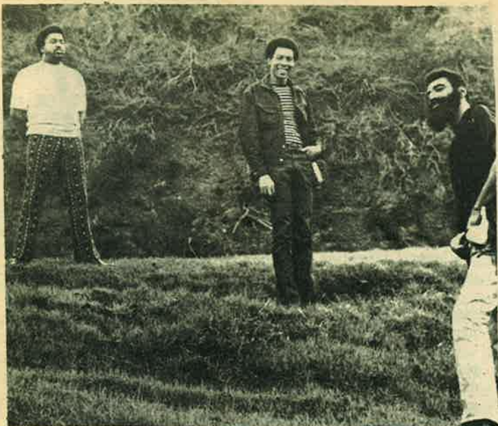
The Three Sounds