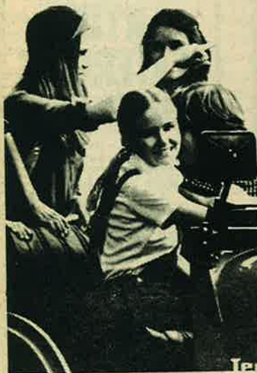
The internal protection more women trust