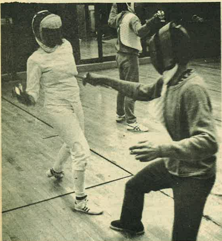
Alright, already, I get the point!

City College's PE department has begun a Monday night community recreation program, held from 7 to 9 p.m. weekly.