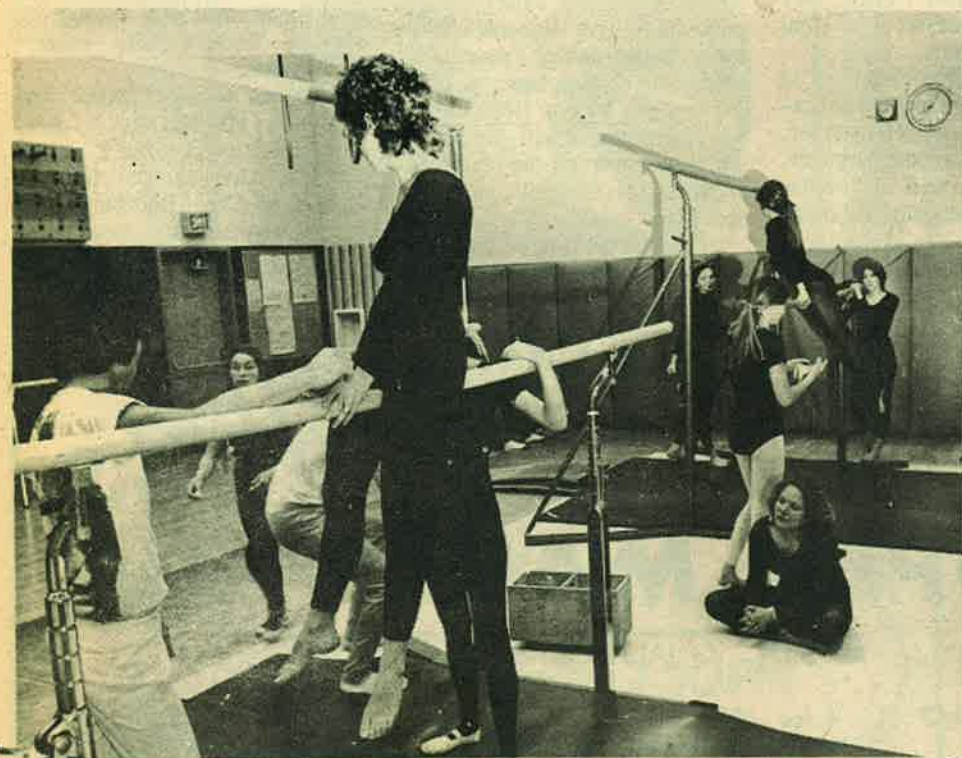
And when you fall on it, it points your Toes!