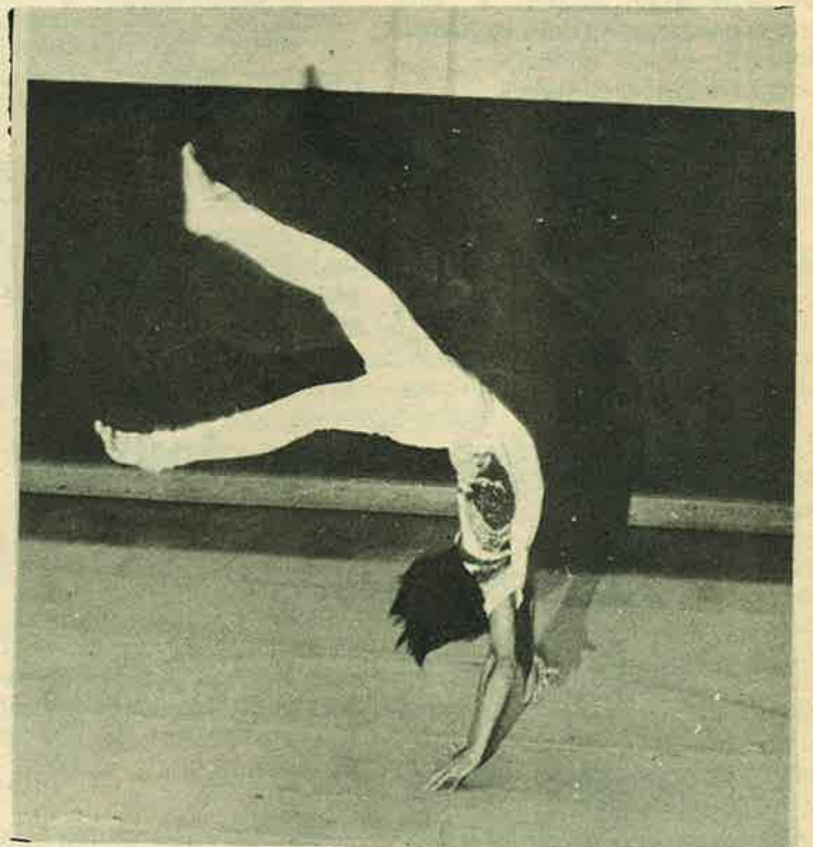
Note my form, legs together, toes pointed! ?

The coaches have attempted to get as many people as possible participating in physical activities. One of their schemes was a Turkey Trot, held on Nov. 22. Other special activities are planned. For further information, contact Dose in his office.