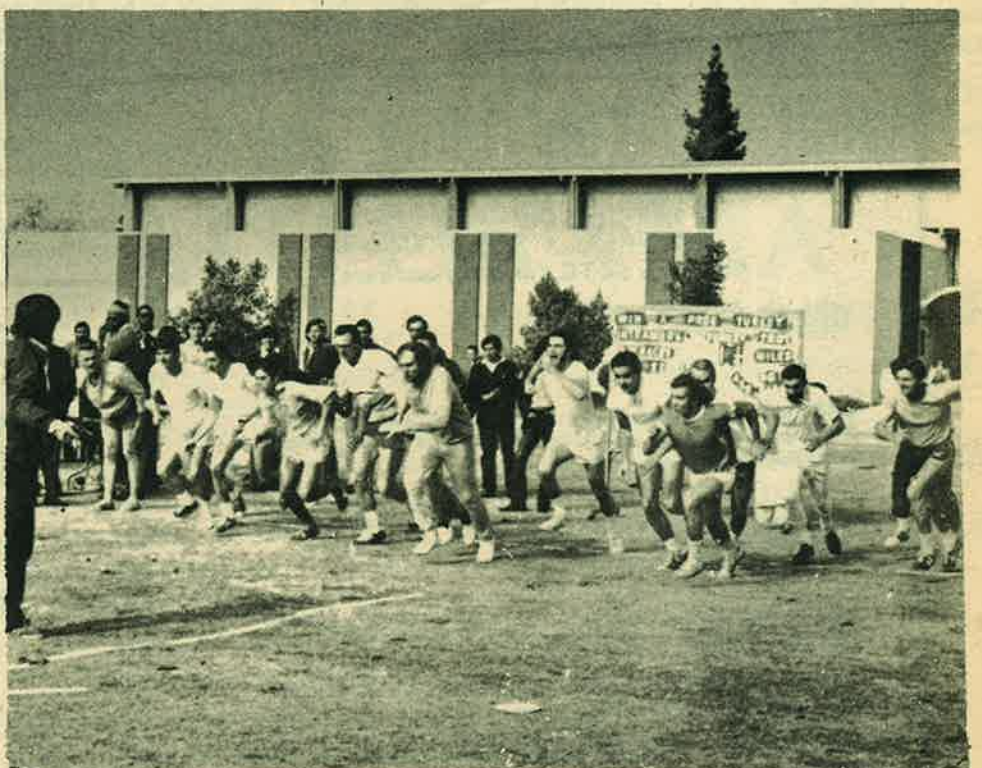
What am I doing here???