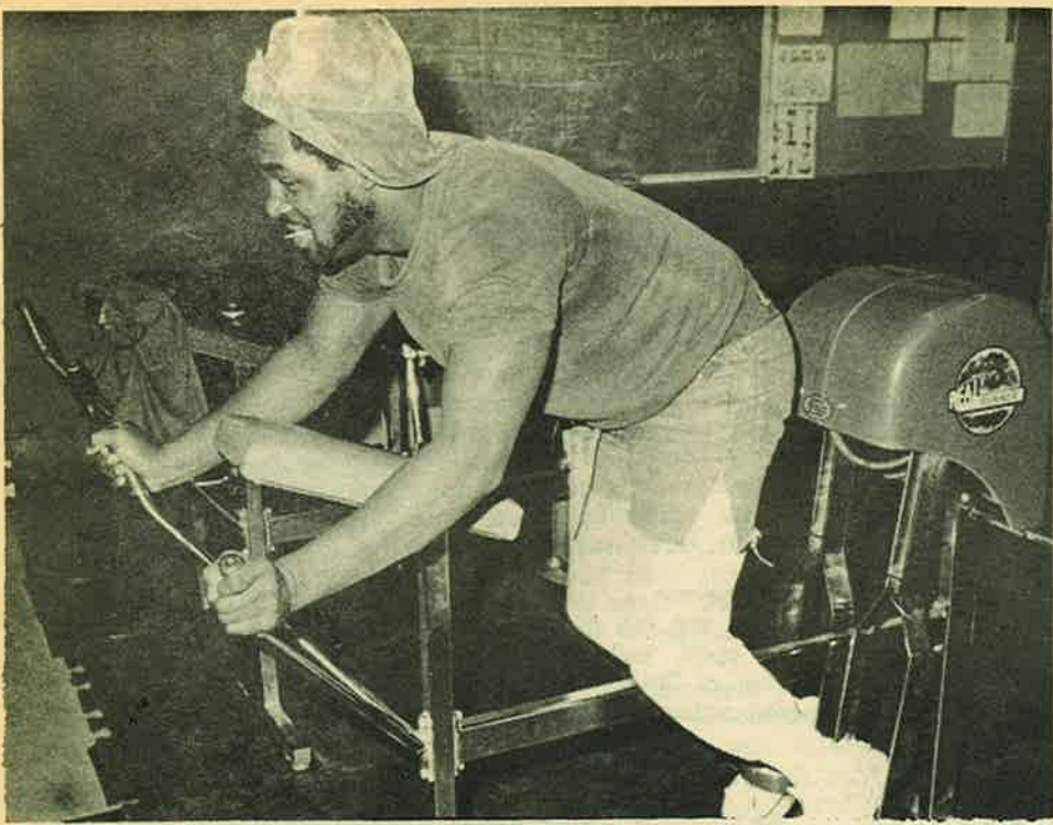
It's a quarterback Curtiss, give him a lobotomy!