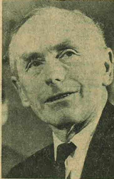
SIR DOUGLAS HOME

Annual fall semester comparison of day student enrollments over the five years show that 2,831 students enrolled in 1960; 3,022 in 1961; 3,333 in 1962; 3,514 in 1963; 3,954 in 1964, and 4,627 in 1965.