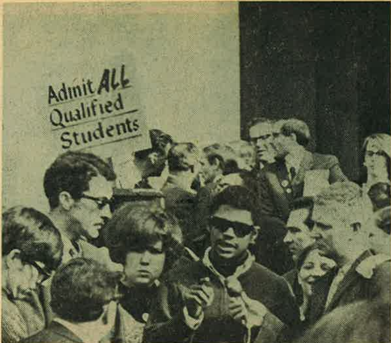
STUDENTS DISCUSS — Students present at the protest march in Sacramento Saturday discuss the issues at stake to a local newsmen on the steps of the Capitol.