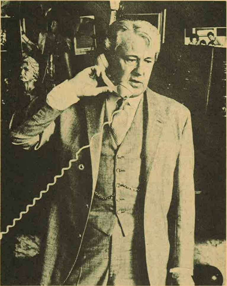
ASSEMBLY SPEAKER—Melvin Belli, San Francisco attorney, will speak on the "Law Revolt" to students in the FCC Gymnasium tomorrow. Belli is remembered as the counsel for Jack Ruby, killer of Lee Harvey Oswald.

that a five cent per book charge is added to the list price if the book is delivered by air. Actual price comparisons between FCC, Reedley College, Fresno State College and Dodgson's Book Center indicated that there are price differences. But such comparisons are very limited by the fact that there are few books used by more than one college. Five Cents Higher Of the four books used by both FCC and Reedley, two were five cents higher at FCC, one was priced the same at both schools, and one was 25 cents cheaper at FCC. Six books were checked between FCC and FSC. Three were five cents higher at FCC and another was 25 cents higher at FCC. Others were 95 and 20 cents cheaper at FCC.