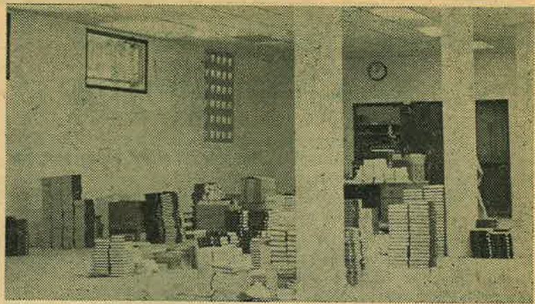
THE NEW BOOKSTORE which will open in three to four weeks, will include a music and dressing room and five check out counters.

Art Carroll, superintendent of construction, said the building operation has gone smoothly so far.