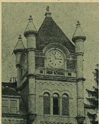
Bell Tower — Old FCC Campus

of the bungalows and the increase of students.