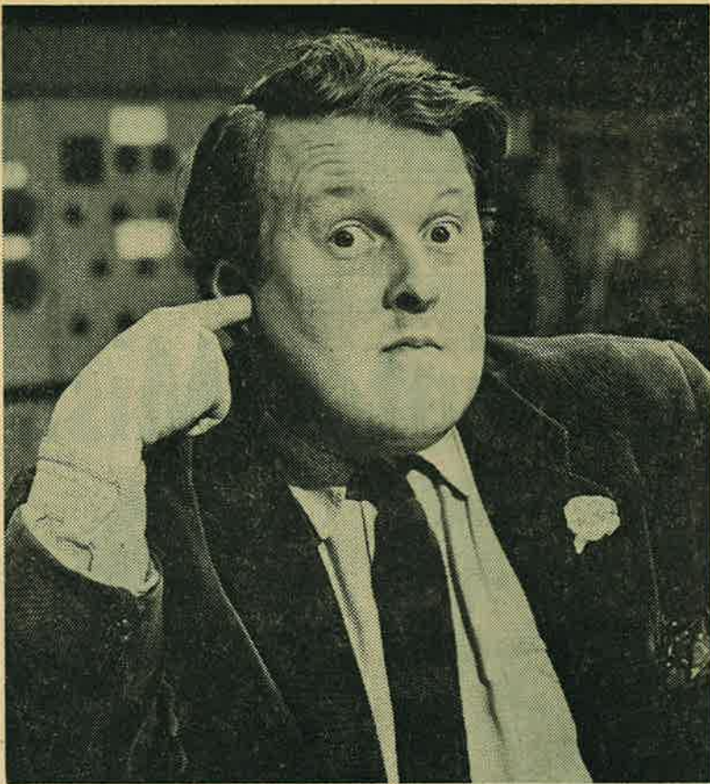
TW3—William Rushton, an "anchor" man for the That Was The Week That Was series will be one of the performers for the TW3 program April 5 in the City College auditorium. The original cast of eight, including star David Frost, will be on hand.