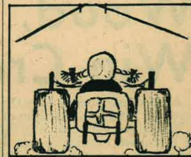
completely converted. I have "drag fever" now and wouldn't miss a 'drag'' for anything. It's great; I hope it becomes an epidemic. 9.

The lights flashed on, and the two racers left the line in fury, clouds of smoke billowing behind them. Screams of tortured protest came from the tires, and on could see the red-hot chins of rubber shooting from them. The flame-spewing exhaust headers from the wailing engines were a brilliant crimson orange, and the exhaust manifolds were nearly white hot. Fumes of burnt nitro and the acid stench of scorched tires filled the air with a pungent fragrance. I stood there shaking and marveling at the man-power it must have taken to control those weird beasts. At the same time I wondered just what it would be like to drive one of them.