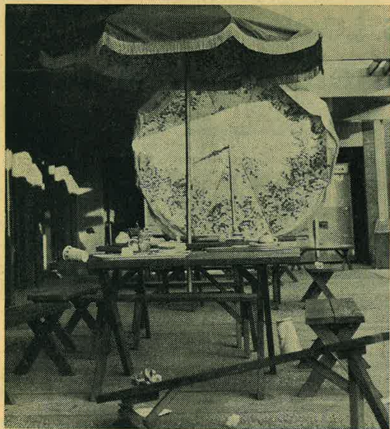
This is how the Fresno City College cafeteria patio looked recently after students had finished eating. Students are requested to bus their dirty dishes and to keep tables clear of trash.