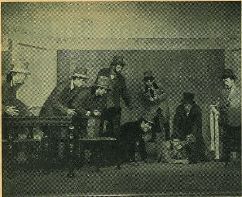
Members of The Inspector General cast go through a last minute rehearsal in preparation for tonight's performance at 8:15 PM.