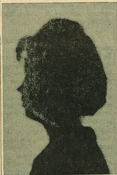
"MYSTERY" CANDIDATE Fine Arts Club