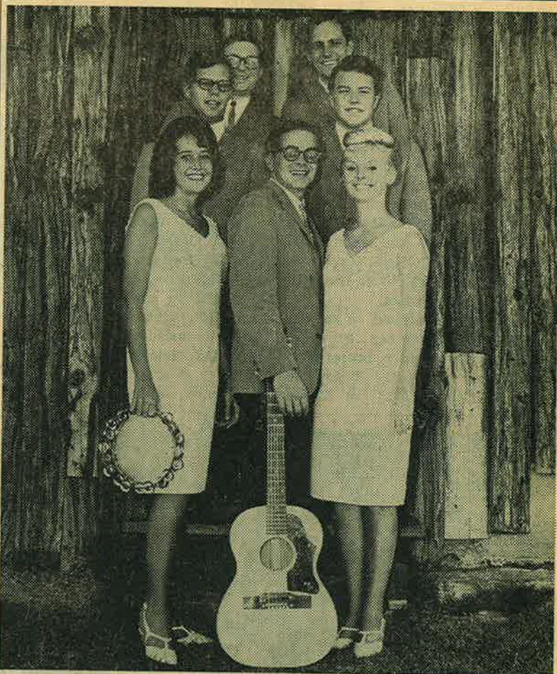
Y'ALL COME — The Greenwood County Singers, a new group on the folk music horizon, will appear in the Reedley gymnasium Saturday at 8 PM. The group is famous for its new "Frankie and Johnny" song. Tickets for the Singers' appearance are on sale in the student president's office for $1.25. The price of tickets sold at the door will be $1.75.