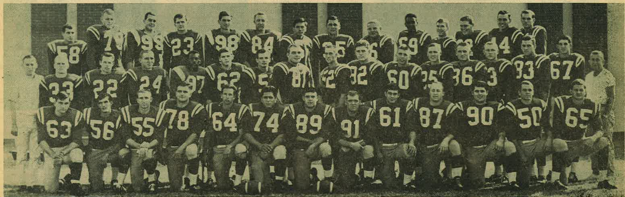
THESE RAM FOOTBALLERS will prepare to face one of three teams November 28 in the Lettuce Bowl. This year the Rams successfully completed a 7-2 record; and tied for the Valley Conference Championship with a 4-1 record.