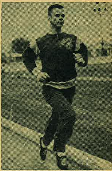
BUSS HELM Cross-country Standout