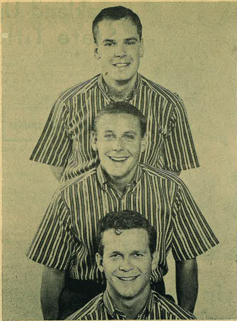
KINGSTON TRIO — Dave Guard, Nick Reynolds, and Bob Shane, top to bottom, will perform Saturday evening at 8:30 PM at Ratcliffe Stadium. The group is sponsored by the Fresno State College student body.