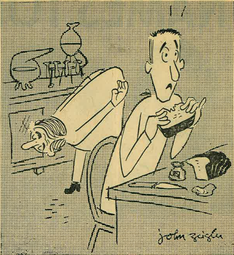
"What liver biopsy?"

"This gives a student complete freedom to say what he wants in class, and it discourages the kind of student that curries favor," says the DAILY BRUIN.