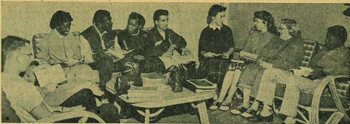
STUDENT LOUNGE — Pictured above is the newly opened student lounge. The lounge is open from 9:30 to 4:30 daily to all students who wish to use its facilities to study, talk, or to smoke.