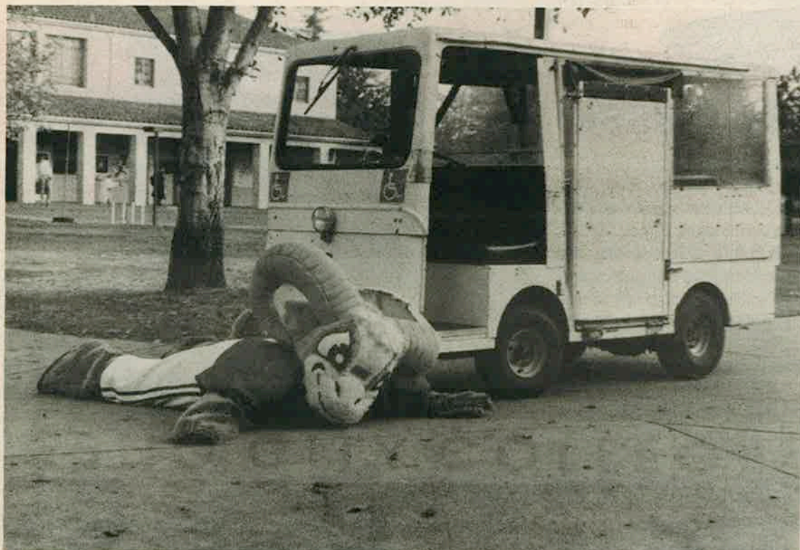
Rocky the Ram minutes after the hit and run