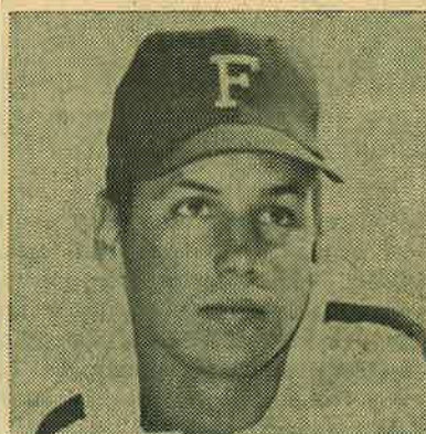
TOM SEAVER Baseball