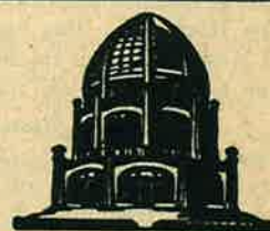
Baha'i Temple, Wilmette, Ill.