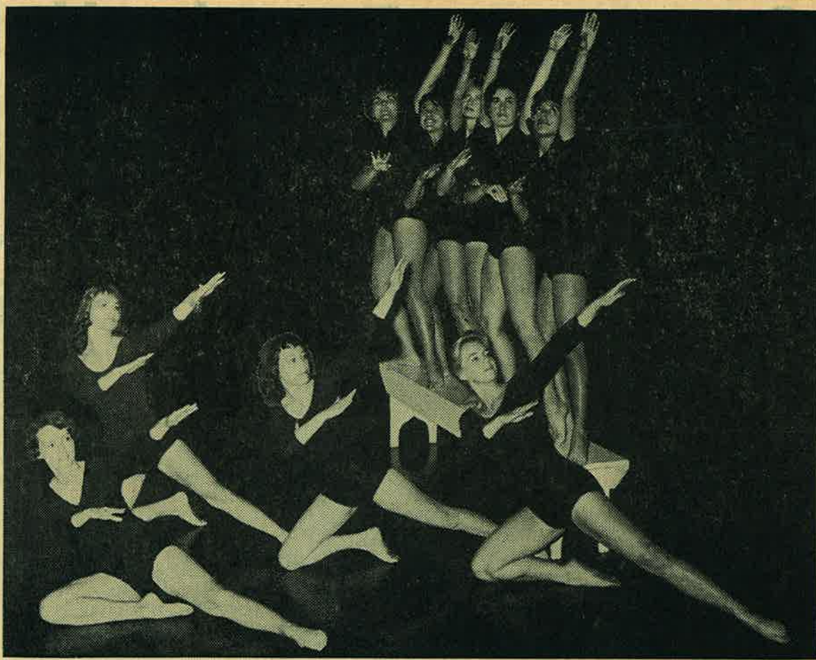
LINE, LEVEL, and LEGS — Modern dance students demonstrate two principles of modern dance through the use of body lines and different levels in space, creating an expressive design.