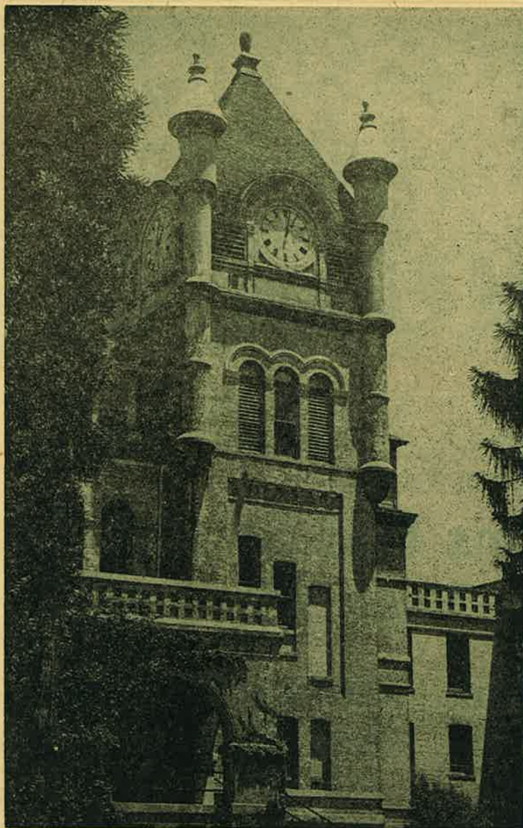
HISTORIC CLOCK TOWER—This clock tower dominated the skyline around the old FCC campus on O St.